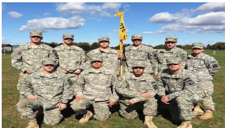
Nathan Hale Battalion Ranger Challenge Team

Cadets from the Nathan Hale Battalion competed in Ranger Challenge at Fort Dix in New Jersey. Ranger Challenge is an event that takes place annually in which Cadets compete against R.O.T.C. programs from other schools. Ranger Challenge consists of events that push the limits of Cadets, both mentally and physically. Events ranged from filling sand bags to evacuating a casualty, to a 10K timed road march.