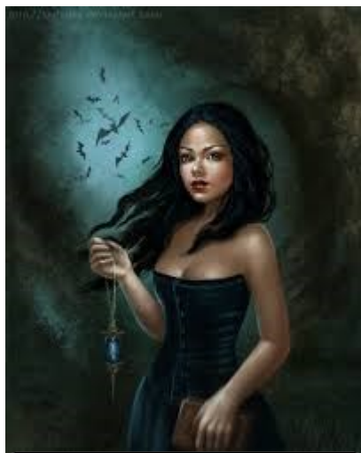
Artists rendition of Clarisse, summoning a swarm of carnivorous bats, as she was famously known for doing

Though she was unable to save her sister, Clarisse managed to free herself and a few other members of their coven by