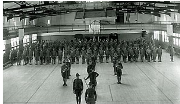
ROTC students line up in this mid-1920s photo of the interior of Hawley Armory. Built in 1914, the Armory was used for many campus and community activities.