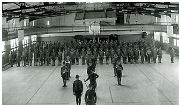
ROTC students line up in this mid-1920s photo of the interior of Hawley Armory. Built in 1914, the Armory was used for many campus and community activities.

If you or a member of the community are interested in assisting with any of our efforts, or have new ideas of your own, we encourage you to come forward and see how together we can make UConn the premier destination for veterans and service members in the United States.