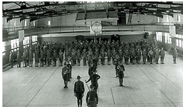
ROTC students line up in this mid-1920s photo of the interior of Hawley Armory. Built in 1914, the Armory was used for many campus and community activities.

If you or a member of the community are interested in assisting with any of our efforts, or have new ideas of your own, we encourage you to come forward and see how together we can make UConn the premier destination for veterans and service members in the United States.