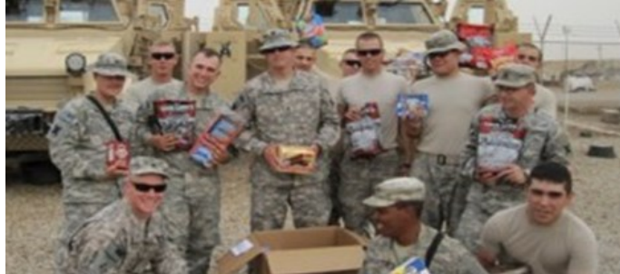
Care Package Drive November 1st–12th