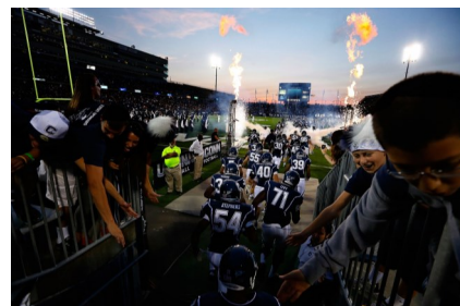
RSVP for the Tailgate by Oct. 31st!